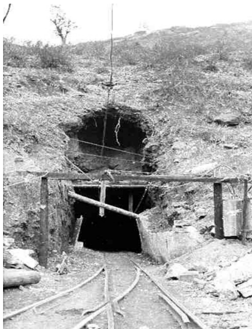
Damage at portal from explosion

On February 8, 1923, an explosion occurred at the Stag Canon #1 underground coal mine at Dawson, NM. The blast killed 121 miners. At about 2:20 PM a mine train jumped its track, hit the supporting timbers of the tunnel mouth, and ignited coal dust in the mine, tearing away the heavy concrete work at the mouth of the mine entry.