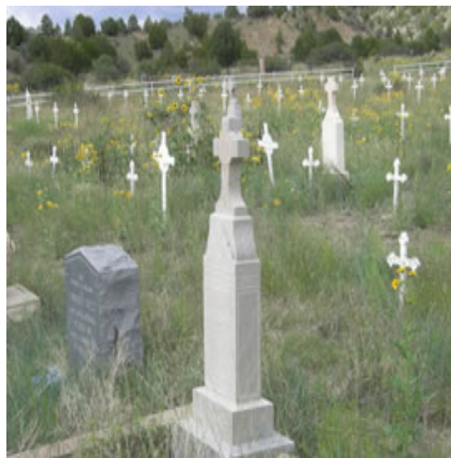
Graves of miners who died in explosion

Let's not forget the accidents of the past as we plan for our fatality free future.